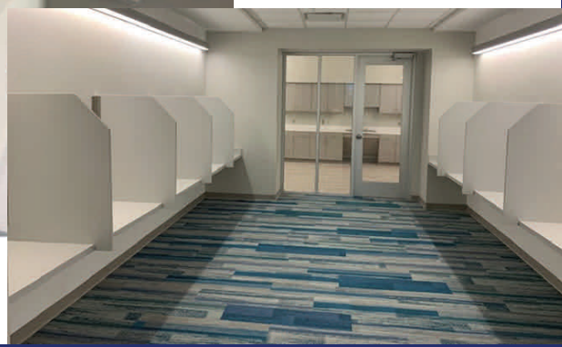
New Physical Evidence—Serology laboratory and reporting stations